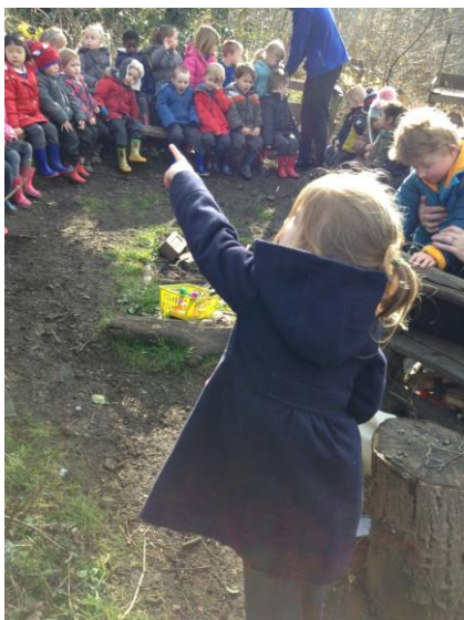
Reception on a dinosaur hunt on the school field.