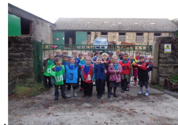
Y1 at St Ives.