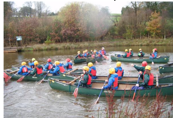
Y6 messing about on the river