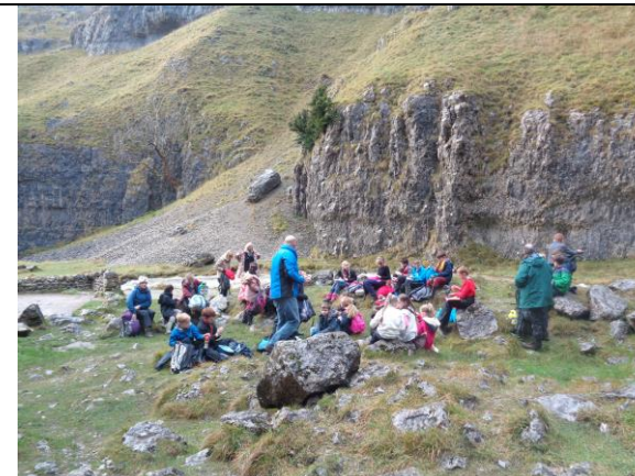
Y5 Malham trip.

We will be exploring this with all of the children and working together to develop our mindsets and to figure out how to work collaboratively to improve all learning opportunities. We believe that this will encourage resilience in our children and will help to develop a love of exciting learning opportunities. We are very aware that the world is moving at a fast pace and we are preparing our children for careers that may not even exist at the moment. By ensuring that our children are independent and confident learners, we are equipping them for a life-long enjoyment of learning. Our work on Growth Mindsets is based on the research of Carol Dweck.