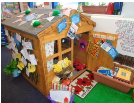
Nursery at St. Ives.

There are so many this year but we just wanted to share a flavour of what the children have been up to.