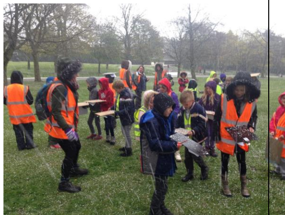
Y4 caught in the hail stones at Yorkshire Sculpture Park.