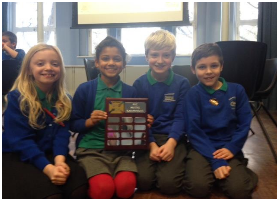
Winning the 4LC maths competition.