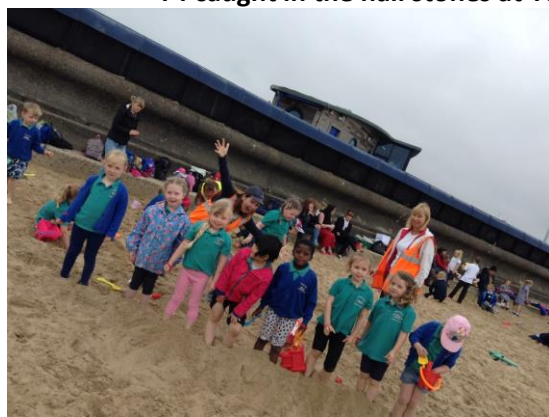
Reception on the beach.