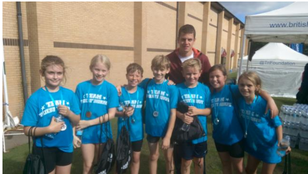
Meeting the Brownlee brothers.