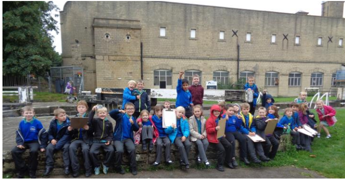
Y3 out and about.